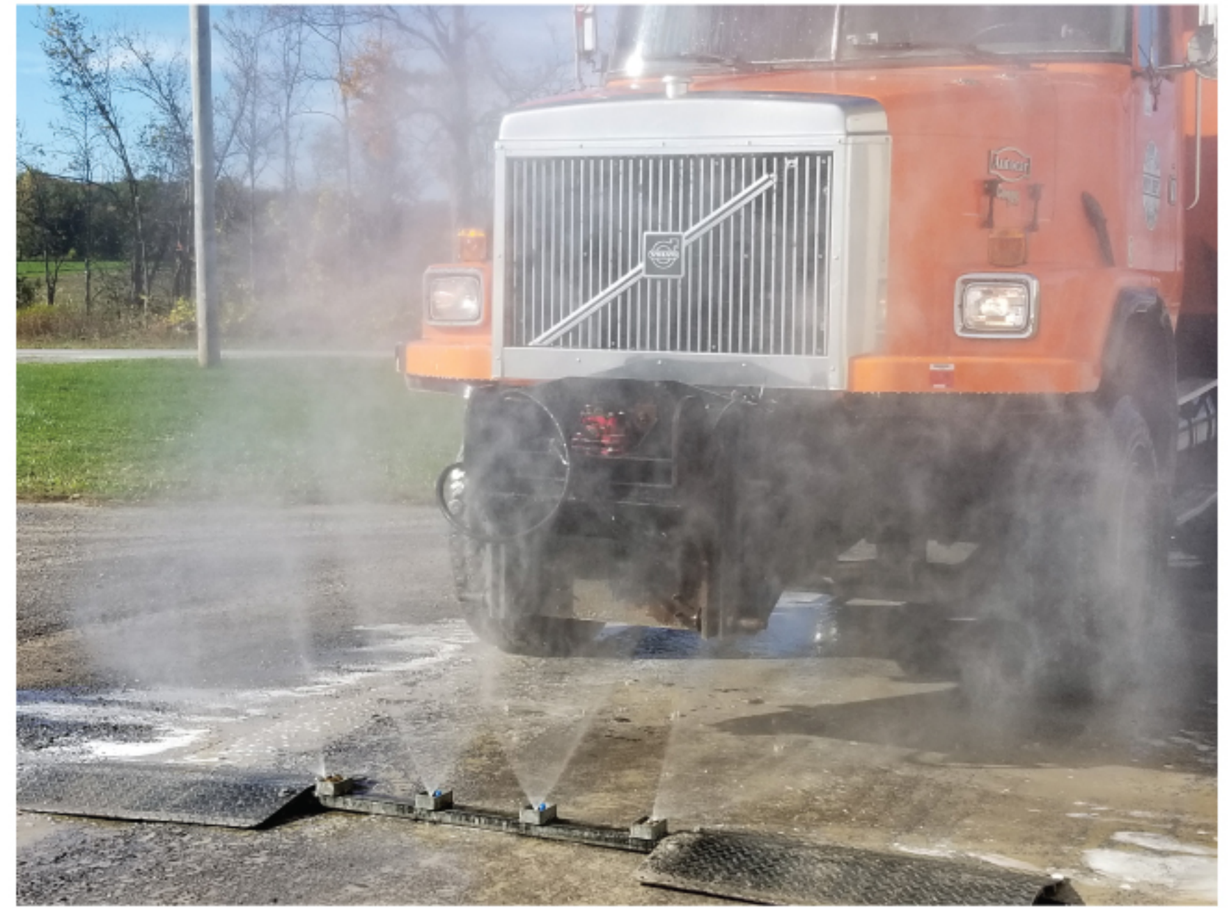
The Neutralizer requires a minimum Pressure washer capacity of 4 Gallons per minute at 2000 PSI.

D-Salt will slow the corrosion process, neutralize the salt & remove the crystallization that is forming on the undercarriage & metal surfaces.