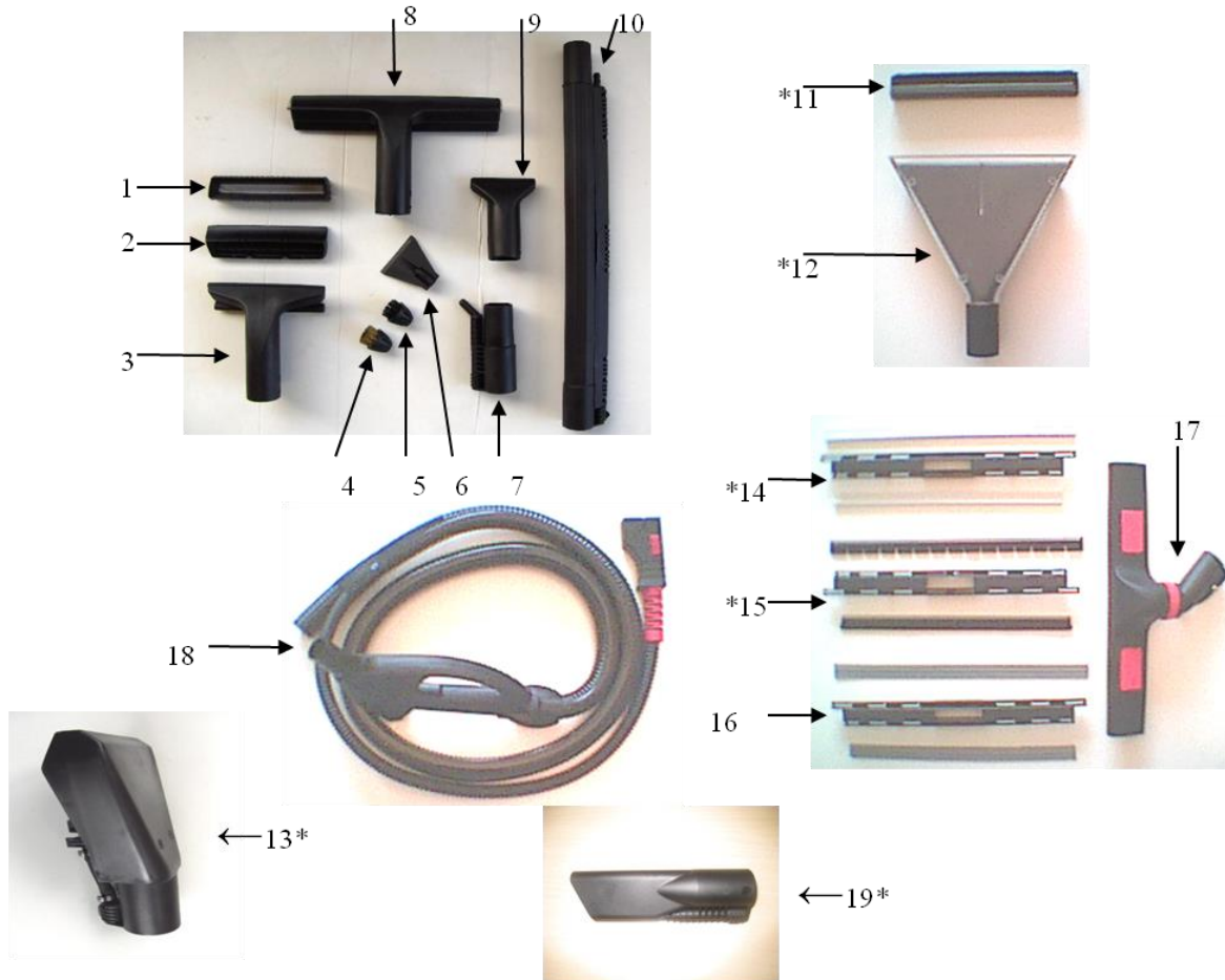
Figure 3- Standard accessories included with this model