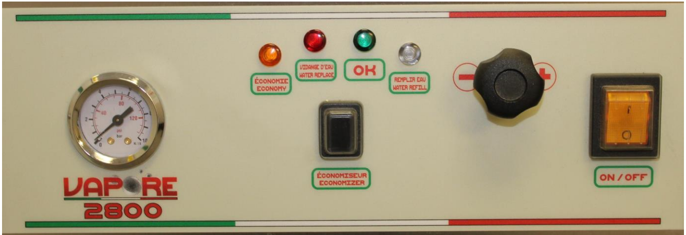
Figure 1- Control Panel