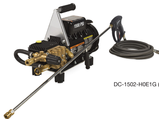
DC-1502-H0E1G (Hand Carry)