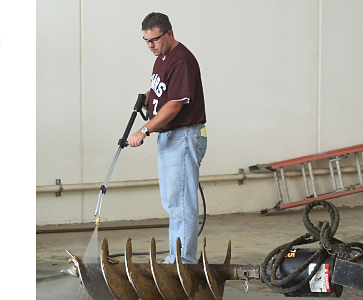
WARNING: Cancer and Reproductive Harm - www.P65Warnings.ca.gov.