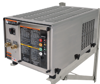
DC-2004-WSE2G shown with stainless-steel wall-mounting bracket, AW-9501-0000

* Replaces the standard 4-foot power cord with a 35-foot power cord.