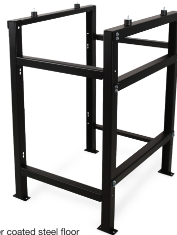
Powder coated steel floor stand, AW-9502-0001